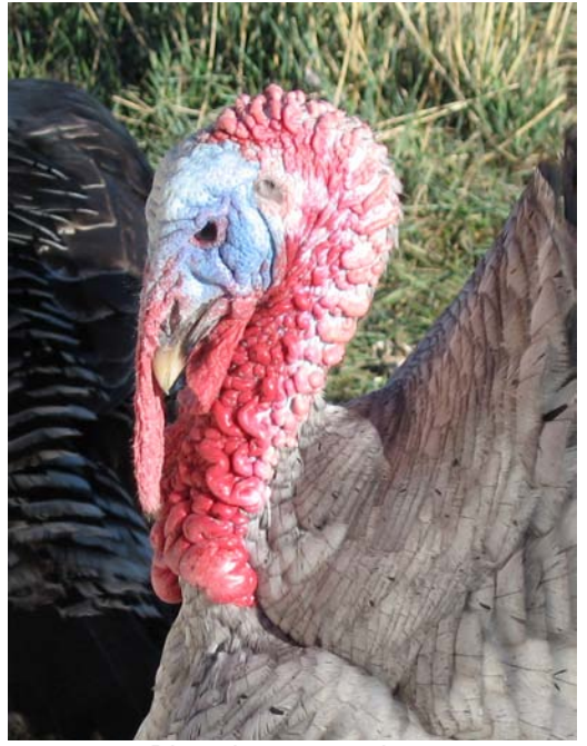
Blue slate tom turkey.

http://www.slowfoodusa.org/ http://www.motherearthnews.com/eggs/ http://www.farmersmarketsnm.org/ http://www.albc-usa.org/